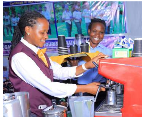
One of the students showcasing her barista skills.