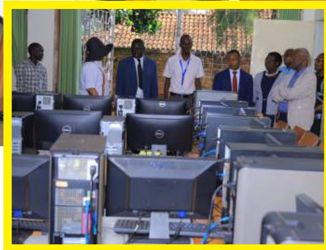
Tourism minister Col (Rtd) Tom Butime during a visit to the library.