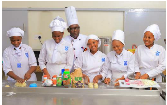
Hotel Management students showcasing their bakery skills.

The Uganda Hotel and Tourism Training Institute (UHTTI) is mandated to train skilled labour force for the budding hospitality sector. The Institute, therefore, has professional staff grounded in the industry and all the tools needed to train a complete hospitality professional, including a fully fledged three-star training hotel that gives the trainees a proper feel of what it takes to work in the hospitality industry.