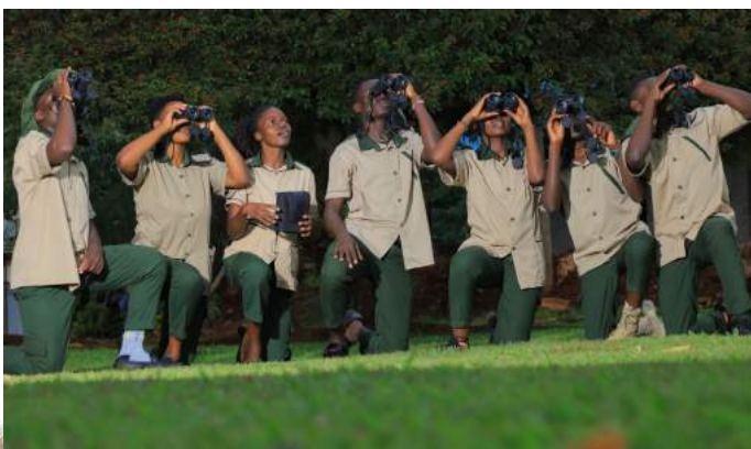
Tourism students using binoculars to view and identify bird species.