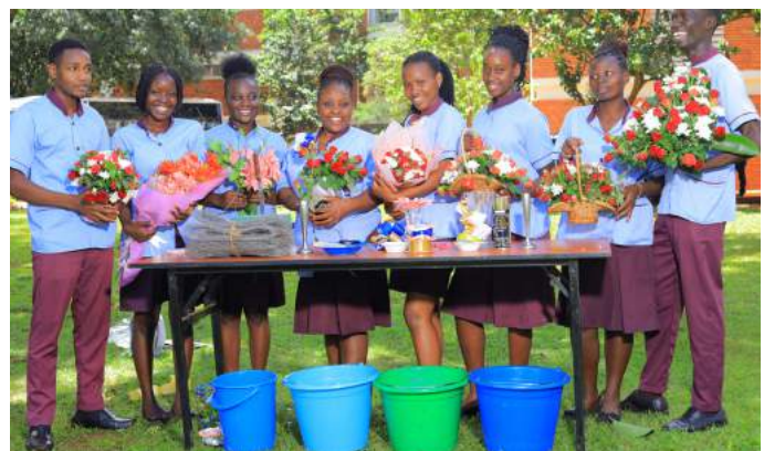
Hospitality students during a practical session.