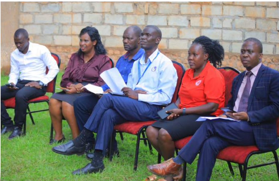
A team from UHTTI Management and staff following the campaigns.