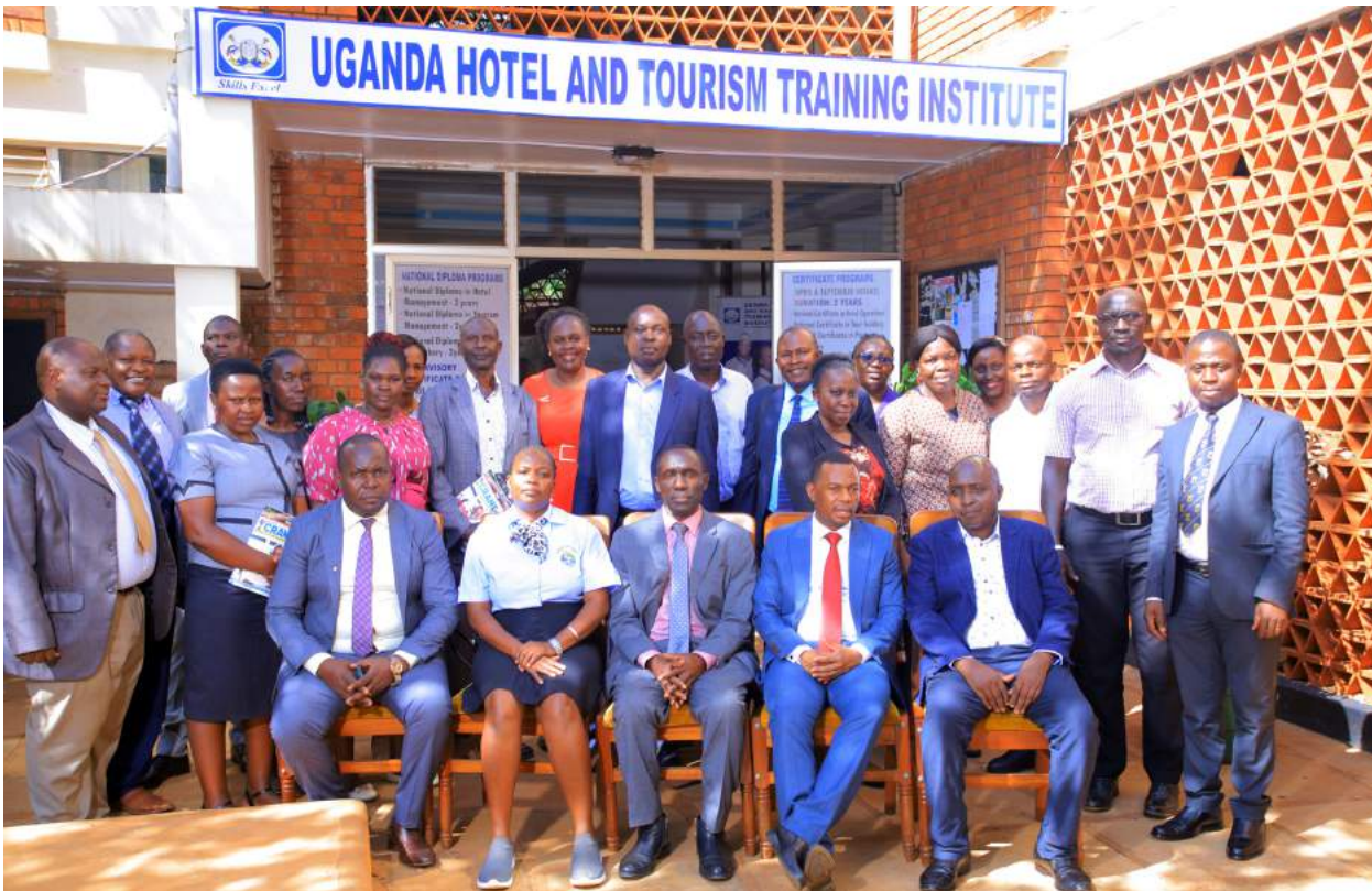
Association members pose for a group photo.