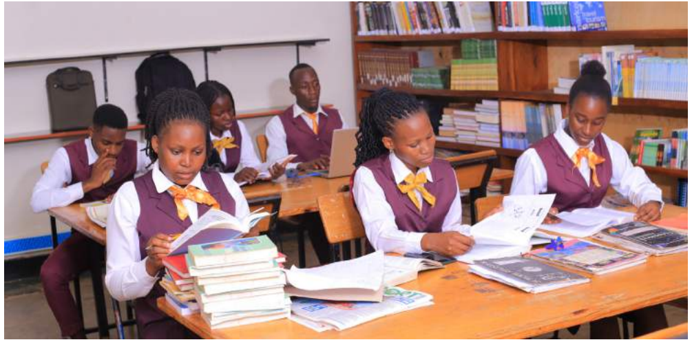
The library is well equipped to facilitate students' research