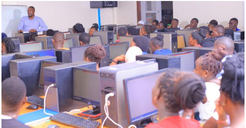
Computer lessons are compulsory for all students. Below, Tourism students in a practical session