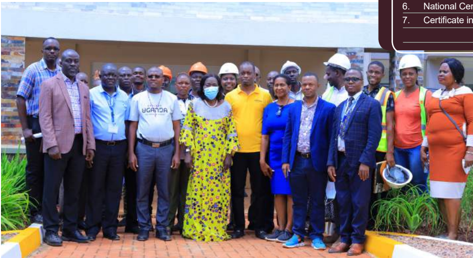
The Institute has a good working relationship with the local leadership.

both professional and academic), Makerere University (Staff training and research), Uganda Hotel Owner's Association (implementing the national apprenticeship program), Busoga Kingdom (research and skills training for the kingdom subjects etc.