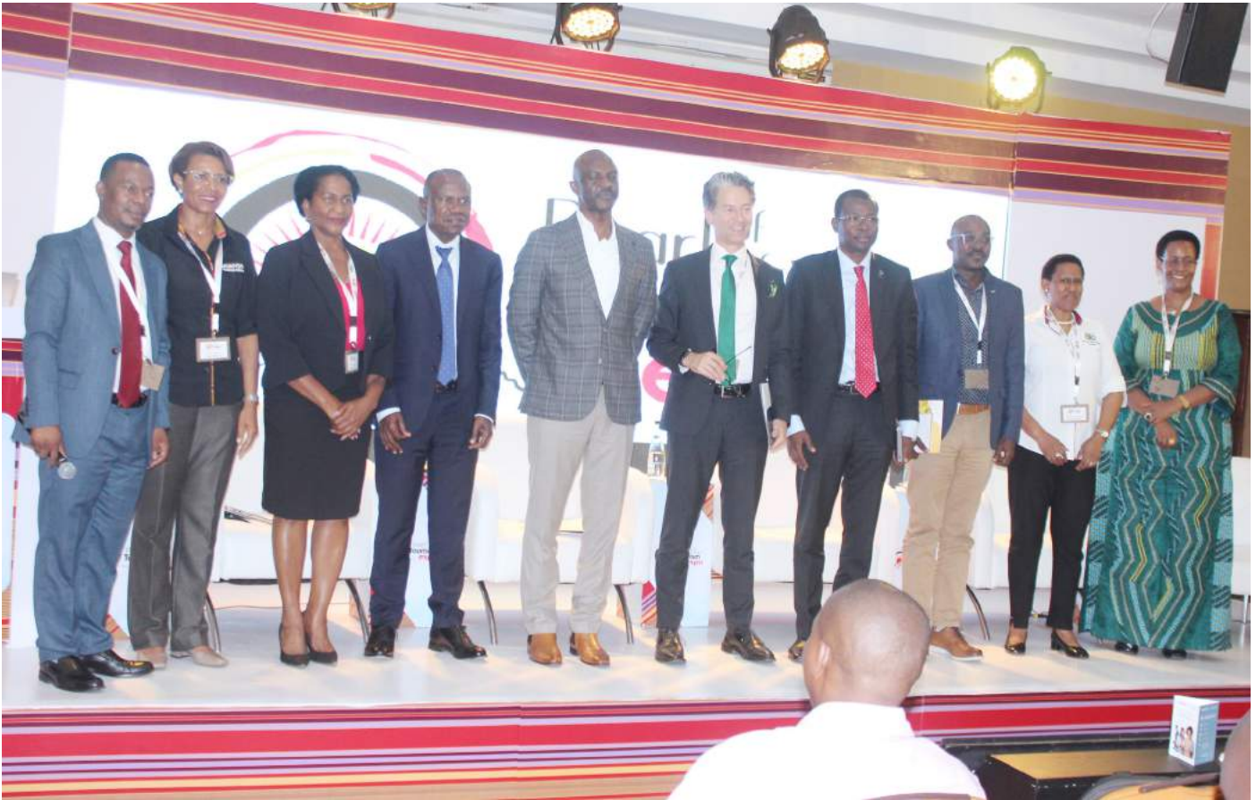
Panelists during the tourism expo. Below, UHTTI Principal moderating one of the POATE conferences at Speke Resort Munyonyo.